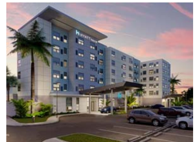
HYATT HOUSE 145-Room Hotel

"In addition to a world-renowned airport, two major malls, dozens of office buildings and more than 7,200 hotel rooms, Westshore also has a growing number of full-time residents who make it a true live-work-play area." - Tampa Bay Times