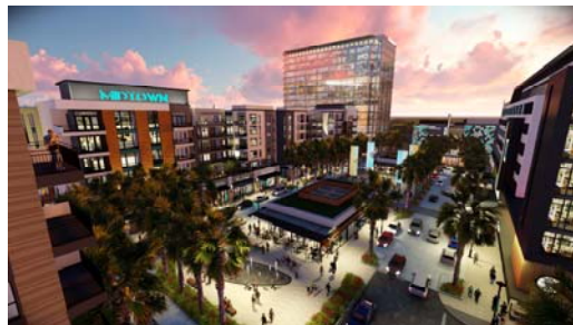
MIDTOWN TAMPA 750,000 SF Office, 240,000 SF Retail, 225-Room Hotel, 400 Residential Units