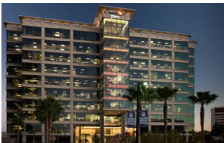
METWEST III 250,000 SF Office