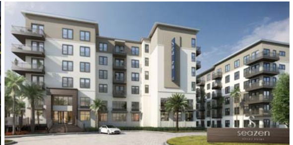
SEAZEN 323 Luxury Apartments with waterfront views overlooking Tampa Bay