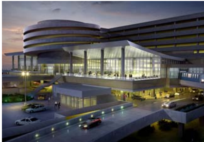
TAMPA INTERNATIONAL AIRPORT EXPANSION PHASE I 2.6 M SF rental car facility, 1.4-mile people mover, main terminal expansion