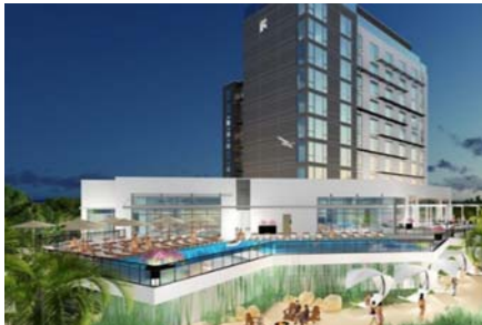
THE CURRENT 180-Room Hotel