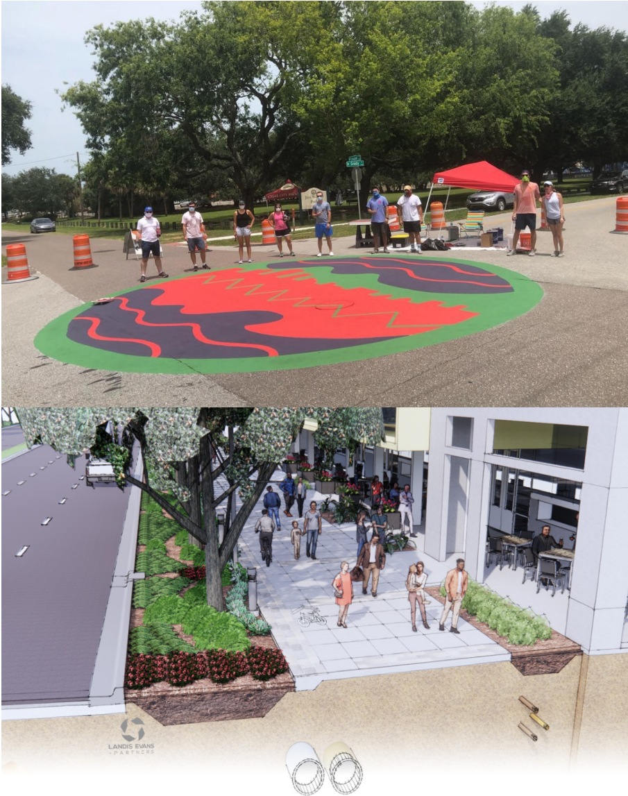
pictured: (top) street mural at Laurel St. & Grady Ave. (bottom) West Shore Blvd. rendering

View complete list of projects in the District on the interactive map on our website.