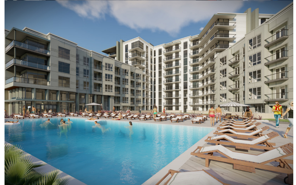
pictured: (top) rendering of Midtown Tampa (bottom) rendering of Rocky Point apartments