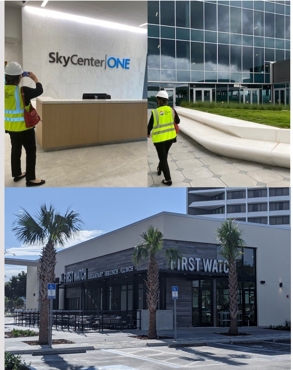
pictured: (top) hard hat tour of SkyCenter One at TPA (bottom) First Watch ready to open at Westshore City Center

SouthState and Oronzo open at Midtown Tampa