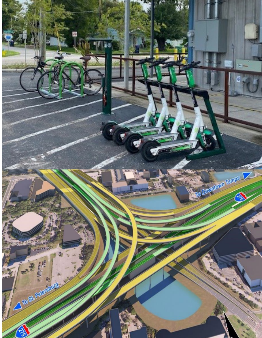
pictured: (top) new bike racks at Cigar City Brewing. (bottom) West Shore Interchange rendering