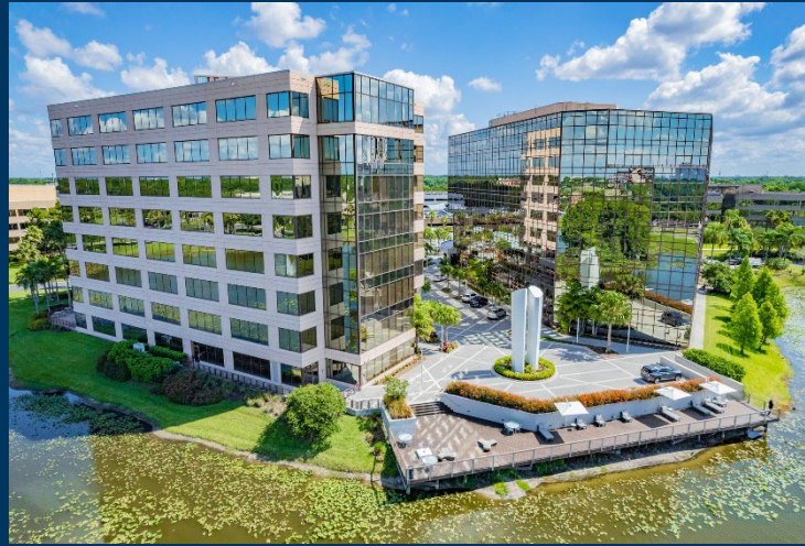
LakePointe One & Two