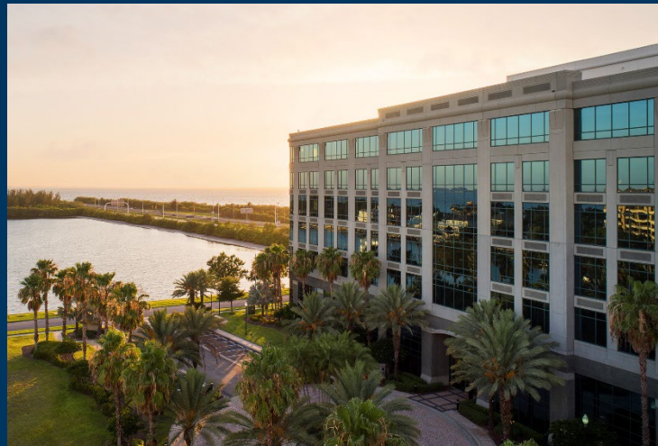
Highwoods Bay Center