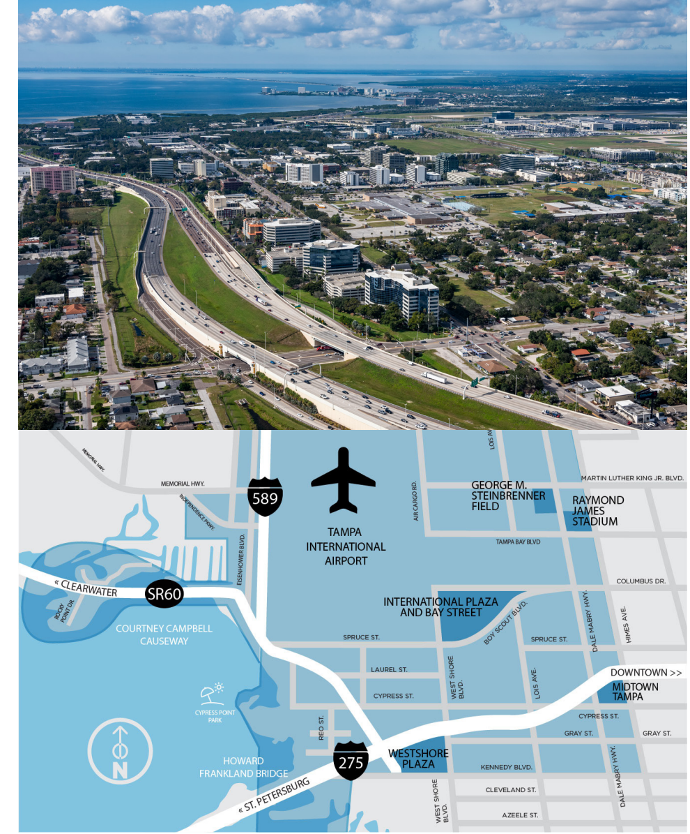
A 10 square mile area on the western edge of Tampa, Westshore is a premium business location, a center of innovation and talent, and an easily accessible location.