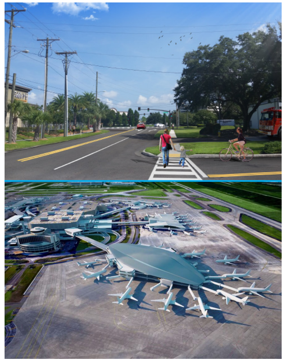
pictured: (top) rendering of Boy Scout and Manhattan with a traffic light and crosswalk/sidewalk (bottom) rendering of TPA Airside D

The number of midblock crossings to be built on Kennedy Blvd (1) and West Shore Blvd (2) in 2023, as a result of the Westshore Alliance's advocacy with FDOT, Hillsborough County, and the City of Tampa.