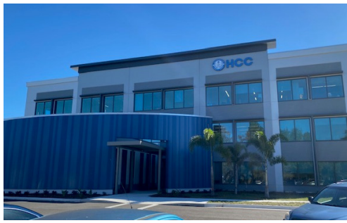
HCC ADMINISTRATIVE OFFICES