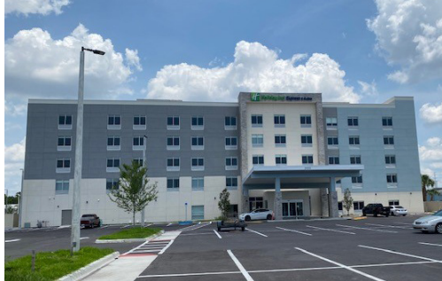
HOLIDAY INN EXPRESS & SUITES