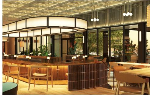
UNION NEW AMERICAN at WESTSHORE CITY CENTER

11-story tower 7-story midrise 180 Units