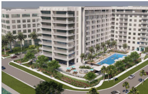
NOVEL BEACH PARK