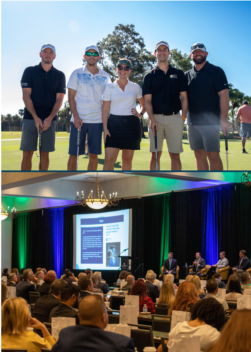
pictured: (top) Golf Classic (bottom) Westshore Development Forum