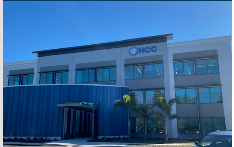
pictured: (top) Union New American (bottom) Administrative Building at HCC