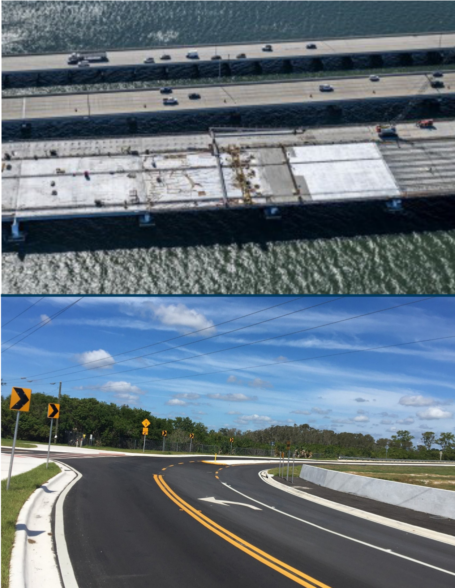
(top) Howard Frankland Bridge (bottom) new intersection and trail on Cypress St at Cypress Point Park.