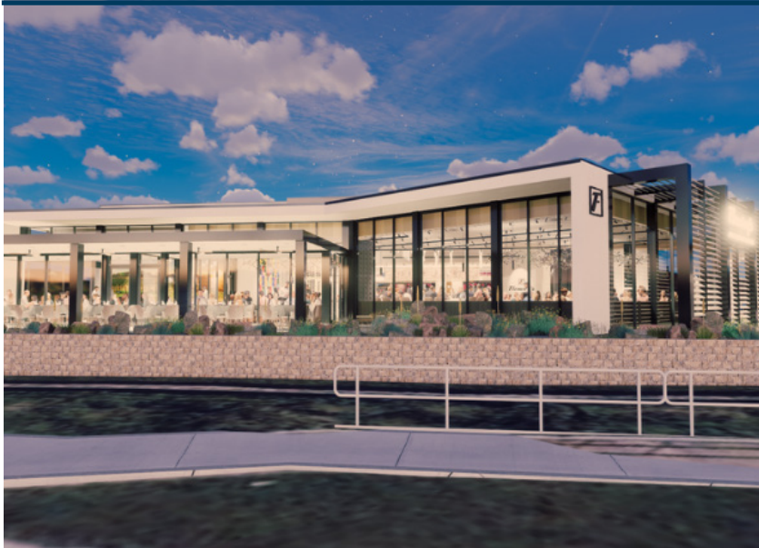
pictured: (top) Blue Express at TPA (bottom) rendering of Fleming's