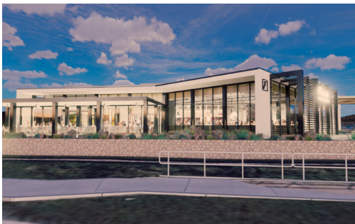
FLEMING'S PRIME STEAKHOUSE & WINE BAR