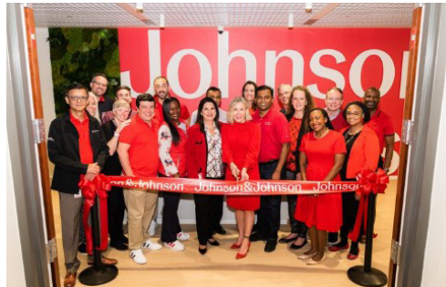
JOHNSON & JOHNSON GLOBAL SERVICES at Corporate Center at International Plaza