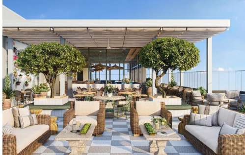
CASA CAMI at The CURRENT Hotel, Marriott Autograph Collection