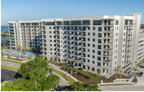
NOVEL BEACH PARK