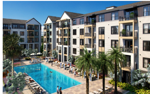
NOVEL INDEPENDENCE PARK