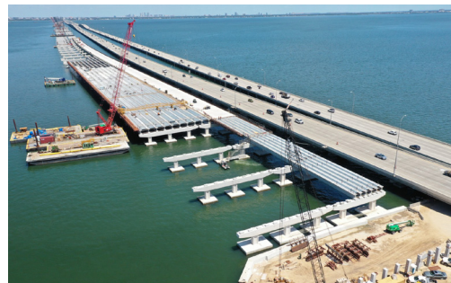
HOWARD FRANKLAND BRIDGE I-275