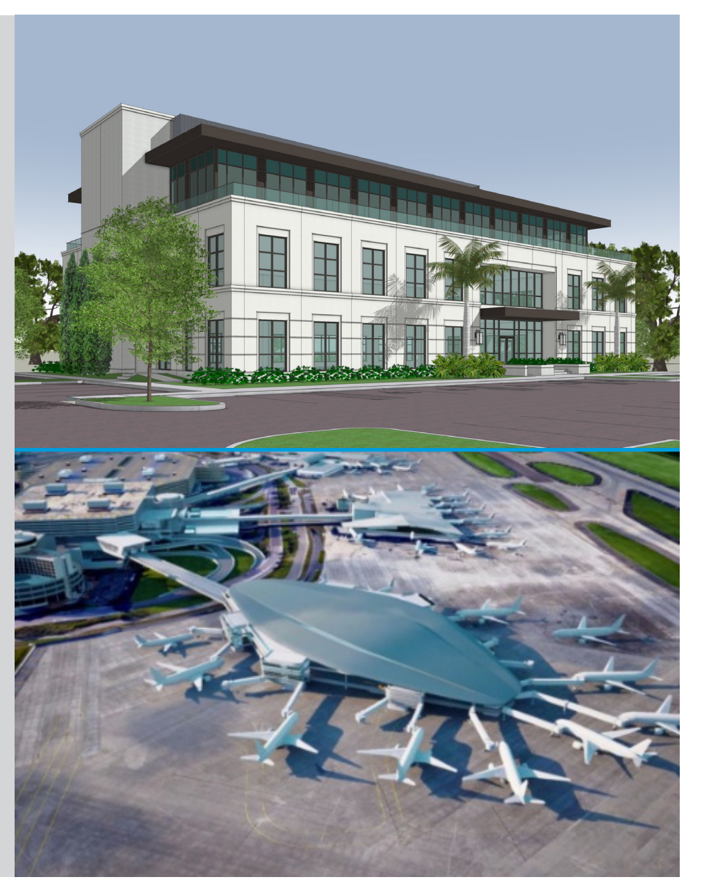
pictured: (top) Harrod Healthcare rendering (bottom) TPA Airside D rendering

WestShore Plaza marketed for redevelopment as Westshore 54 - a reference to the acreage available for redevelopment