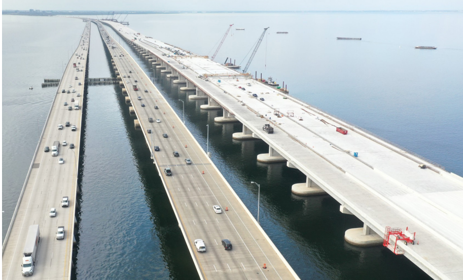
pictured: (top) Roland Park IB K-8 mural (bottom) Howard Frankland bridge