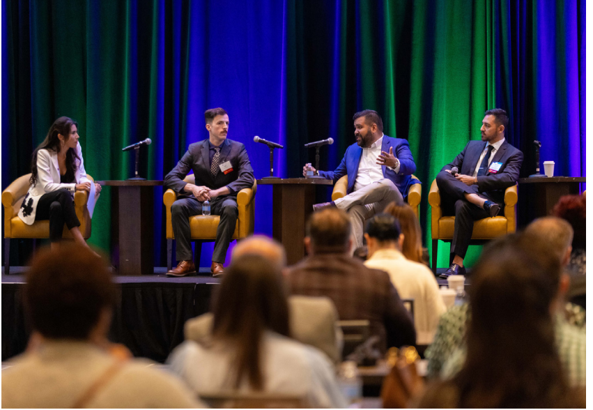
pictured: (top) Golf Classic (bottom) Westshore Development Forum

Event lost to Hurricanes Helene and Milton. Thank you to our members, guests, and sponsors for their support of our programming in response to the 2024 hurricane season.