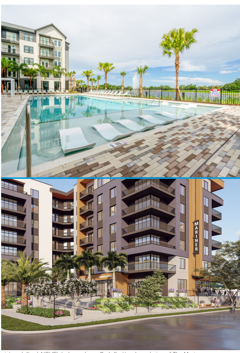
pictured: (top) NOVEL Independence Park (bottom) rendering of The Mariner